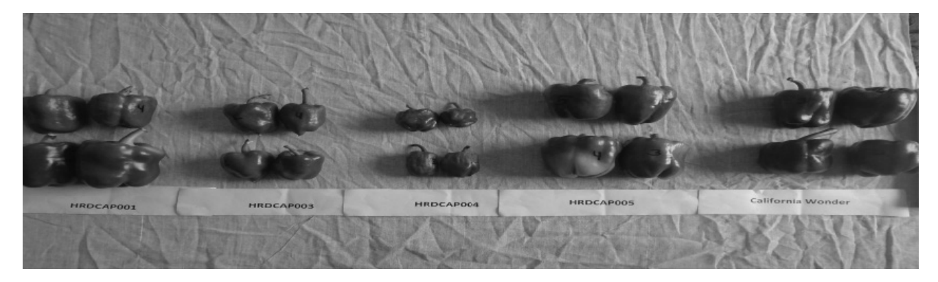
Figure 1. Fruit of capsicum genotypes under study

Fruit length of capsicum genotypes varied markedly with California Wonder having longest fruit length (86.31 mm) which was at par (p>0.05) with HRDCAP-001 while HRDCAP-004 had shortest length (Figure 1 & Table 1). Farooq et al., (2015) reported significantly different fruit length in different sweet pepper hybrids whereas similar information was also documented by Khokhar et al., (2006) in different tomato hybrids. Furthermore, Hasan et al., (2014) also reported the varietal variance in fruit length of chilly lines.